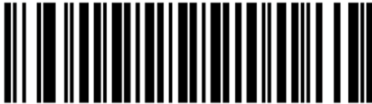
6. Enable UPC-E (1)